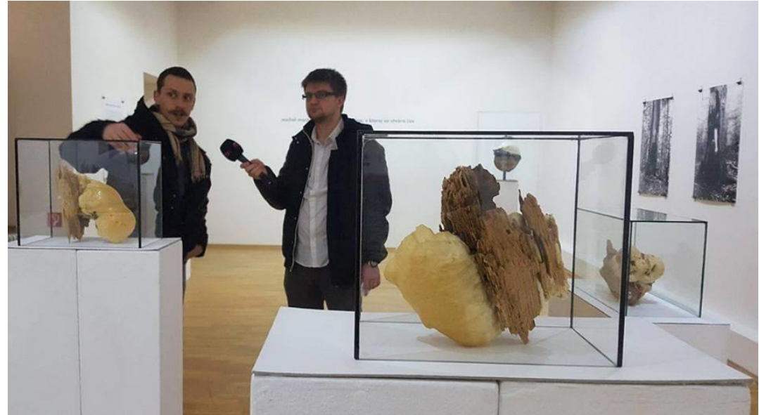
Documentation Centre, East Slovak Gallery, File on the artists of the 21th century, artist's talk

II. 9: „Only knowledge gained through research will allow the museums to fill their potential and offer it to the public. Research is extremely important for museums, also because it allows them to look at the history in the contemporary context, to interpret, represent and exhibit the collections. ”