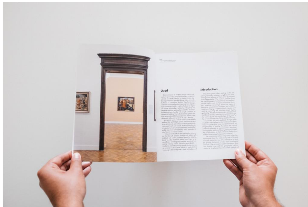
Exhibition catalogue, Exiled, 2017/2018, East Slovak Gallery

. outputs from other professional activities