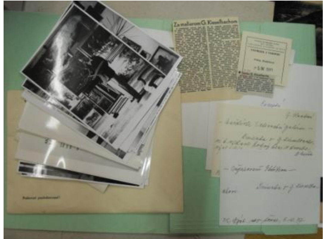
Documentation Centre, East Slovak Gallery, File on the artists of the 20th century