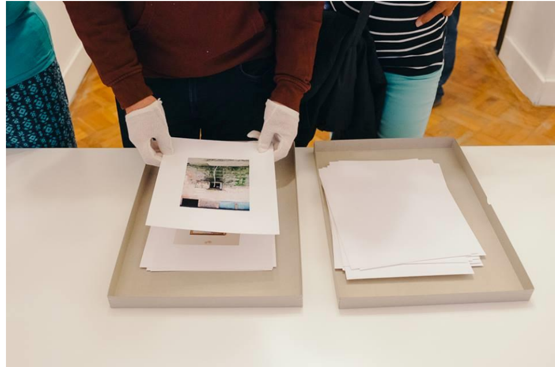
Documentation Centre, East Slovak Gallery, work in exhibition