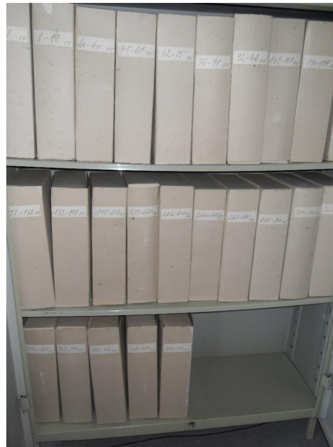
Documentation Centre, East Slovak Gallery, Photo Exhibition Collection, 1952 – 1985

It forms part of the museum's knowledge system as a professional information database of the museum's specialization and orientation.